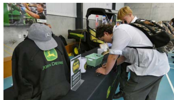
The boys got involved with the chance to win 1 of 2 John Deere hoodie and cap packs.

ENTER YOUR PHOTOS AND FEATURE IN OUR 2024 CALENDAR