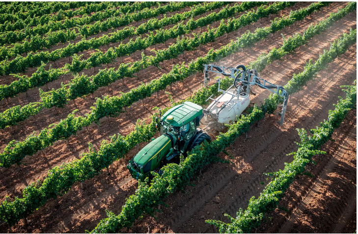
John Deere will transform its offering to the orchard, tree nut and vineyard industries with the new 5ML series of cab tractors