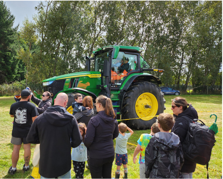
The queue for a tractor ride is grateful to have a burst of sunshine to wait their turn in at the Southland A&P Show.

Thanks for having us Southland A & P Association, and for a fantastic event.